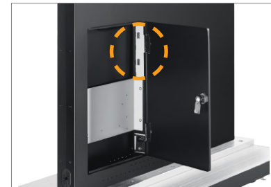
HDMI connections for connecting media players/ IPC