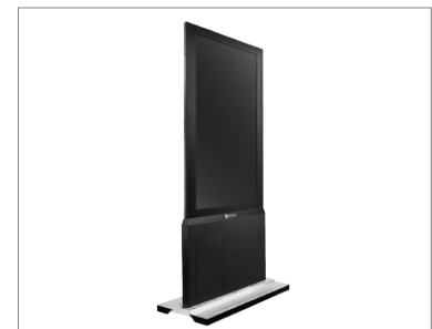
Durable metal housing