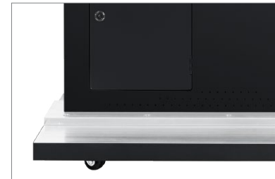
Free standing and movable floor stand on removable casters