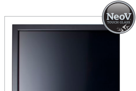
NeoV™ Touch Glass keeps the screen protected and looking new