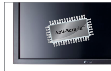
Anti-Burn-in™ technology prevents image sticking