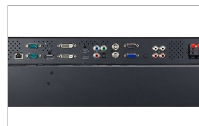
Multiple video inputs (VGA, DVI, HDMI, BNC, S-Video, DisplayPort and Component) allow for effortless system integration