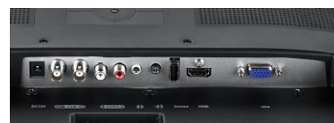
Video versatility, including VGA, HDMI, and BNC In/Out