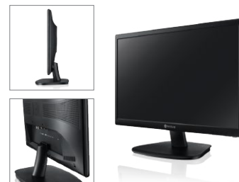
Stylish and slim design ideal for professional security environments