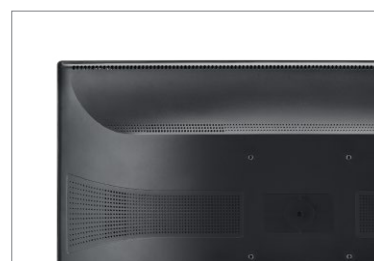
Built-in speakers enable more rigorous security monitoring