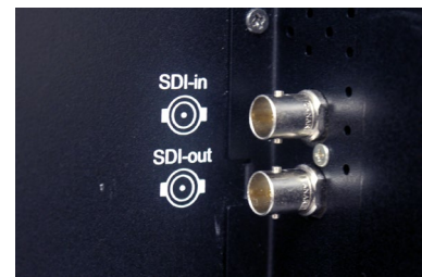
SDI inputs bring forth mega-pixel images without interruption or delay