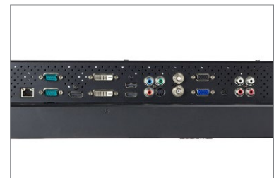
Multiple video inputs (VGA, DVI, HDMI, BNC, S-Video, DisplayPort and Component) allow for effortless system integration