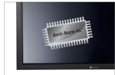
Anti-Burn-in™ technology prevents image sticking